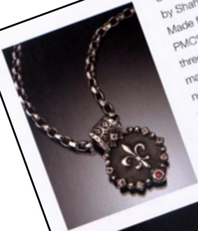
Celechée Earrings by Shahasp Valentine. Made from standard PMC®, pressed into three different molds making twelve components, which were assembled into the finished earrings, using white sapphires.