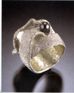
Organic Ring #21 by Shahasp Valentine. From the "Organic Series" of naturally inspired forms. Made with fine silver PMC® with black pearl.

Rings can be made with an individual's style in mind. Unusual shapes and textures add to the intrigue of each artist's interpretation of a design. Handmade rings that are less than perfect have a certain charm. They look like antiquities made by silversmiths before modern machinery made it possible to mass produce rings and other jewelry items.