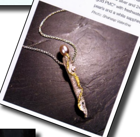
Wave Necklace #14 by Shahasp Valentine. Hand-formed fine silver and 24K gold PMC® with freshwater pearls and a white sapphire.